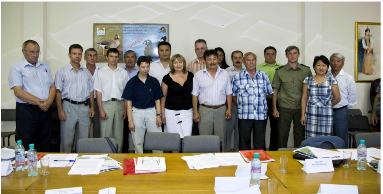
The Interregional meeting about optimization of use of waterfowl of Kumo-Manytch stopover in Kalmykya Republic, Stavropolsky kray and Rostovskaya oblast, 15 of June, Elista (Kalmykya)